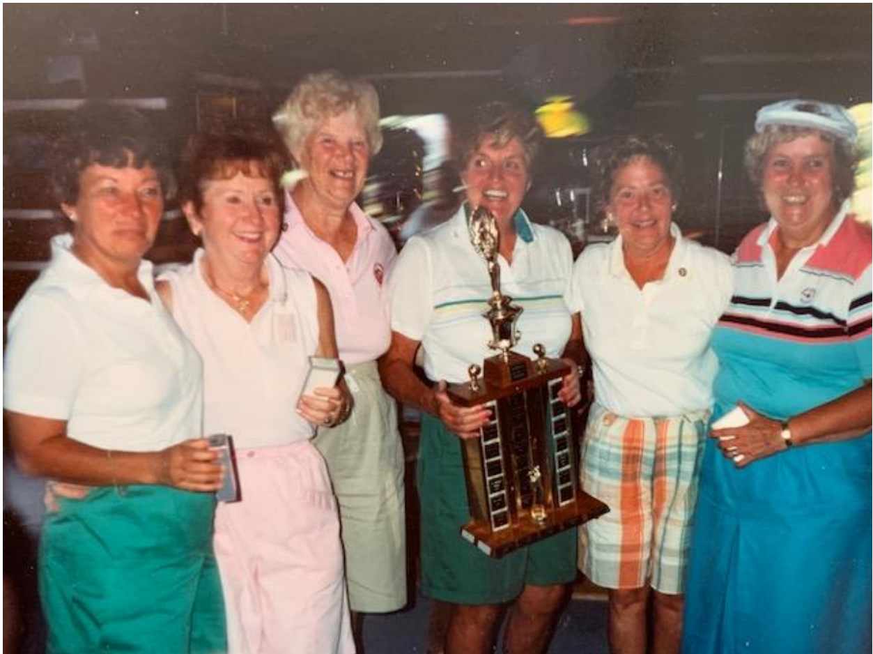
Dunany bringing home the Inter Club Trophy in 1990:

Even though the Laurentian Inter-Club no longer exists, bringing it to Dunany provided our Dunany lady golfers with 40 years of great golf enjoyment and exposed them to the other wonderful courses that we have at our doorstep! Thank you to all who made this happen!