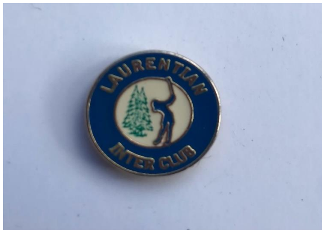
Inter Club Pin