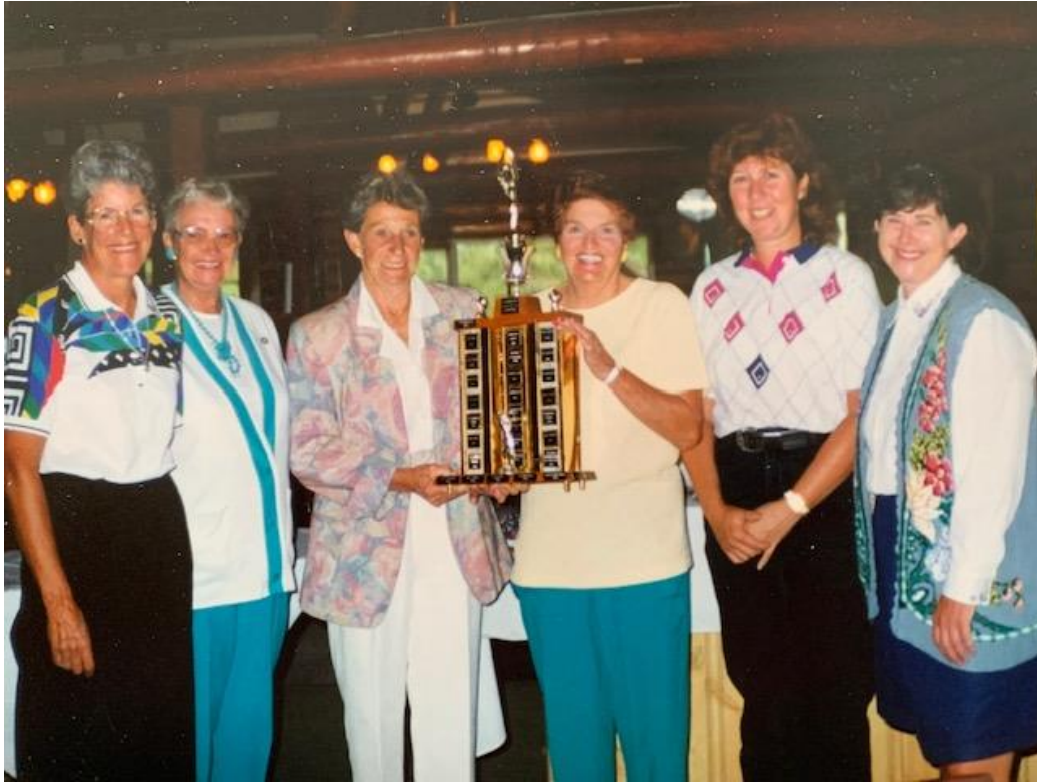
Trophy being presented to the Arundel Team – August 31, 1995