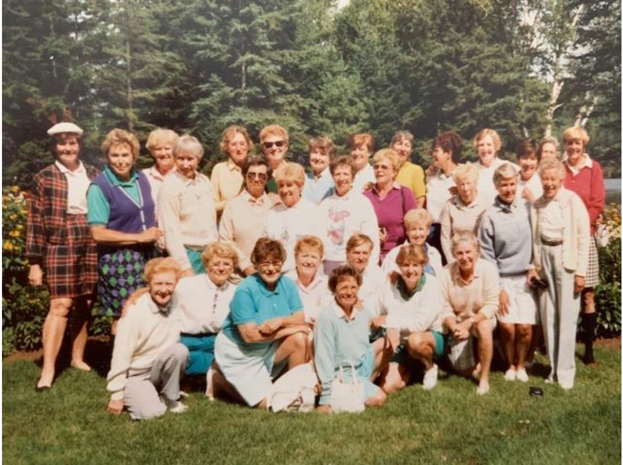
Laurentian Inter Club 30 th Anniversary Party at Lac Raymond – August 1992