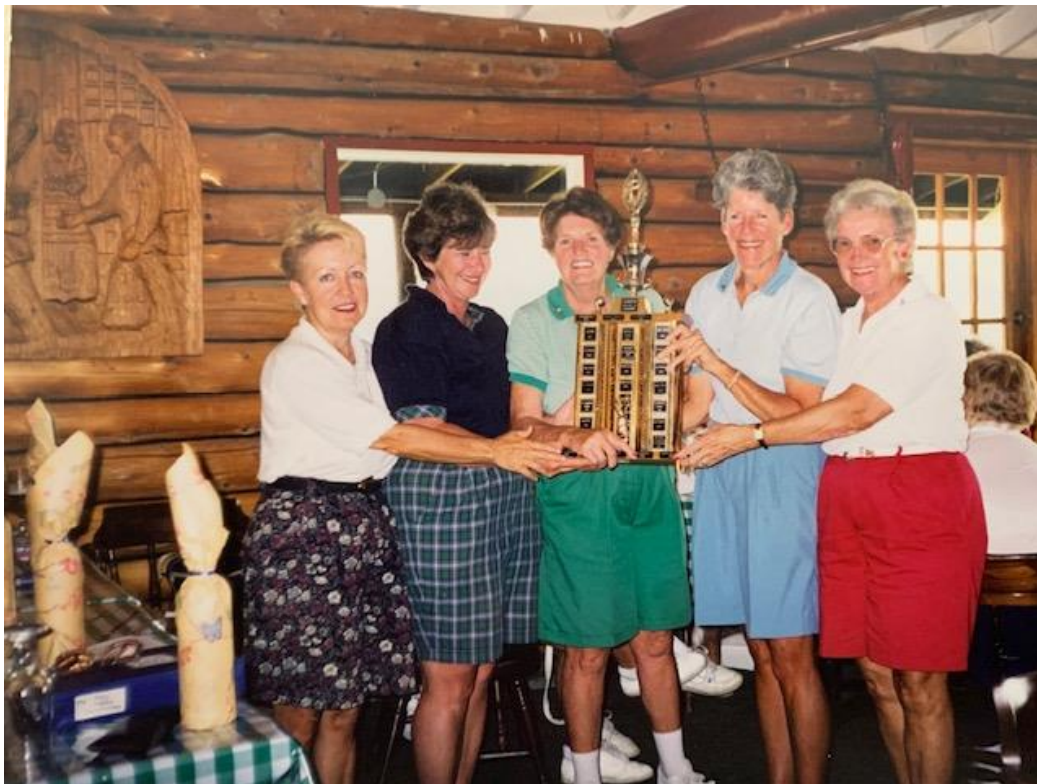
Trophy being presented to Arundel team – August 1997