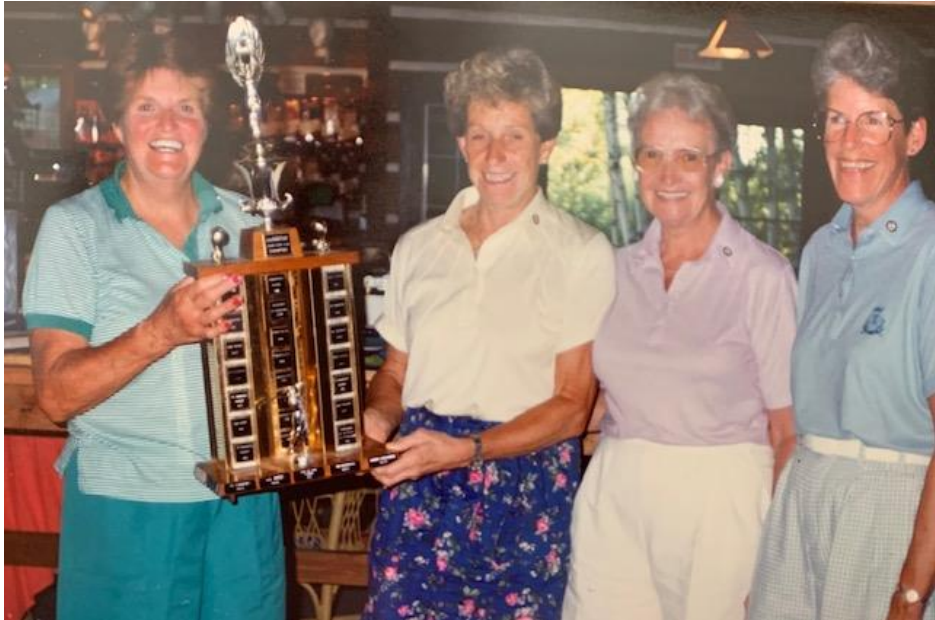
Presenting the Trophy to Laurentian Inter Club winners – Arundel - 1993